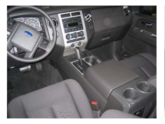
View of vehicle w/ full console & console shifter